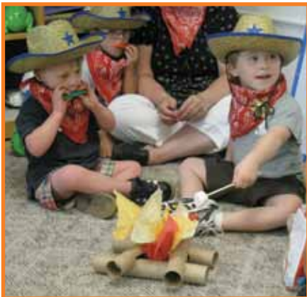
Students sing songs and "toast" marshmallows to celebrate the summer Western theme.