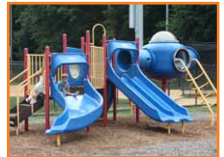
Having summer fun in the playground at our new location in Roseland.