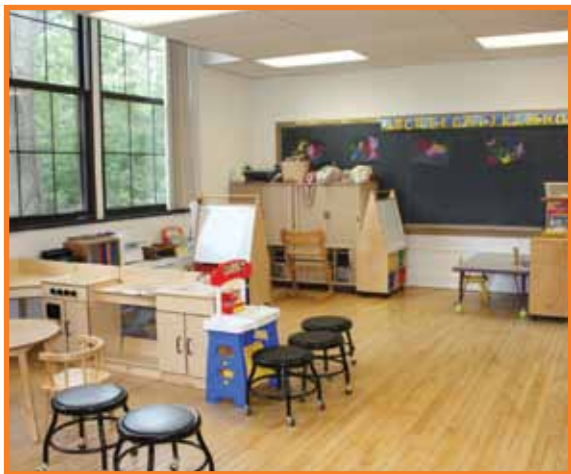
A new spacious classroom, almost ready for the first day of school.