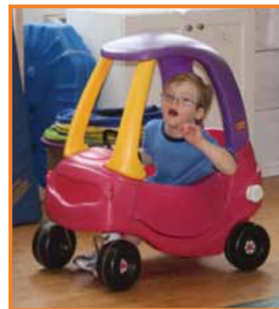
A student in the Stepping Stones' Extended School Year Program takes a spin around the school's new surroundings.

This September, 2011, not only starts a new school year for Stepping Stones, but also a new beginning! The Stepping Stones School and Early Intervention Program has moved to their new home on the second floor of the Roseland Town Hall Building, which was previously an elementary school. Stepping Stones School and Early Intervention are unique special educational programs for children from birth through 9 years with developmental and intellectual disabilities. These programs are specially designed to provide the most up-to-date therapy and educational supports for the children and their families.