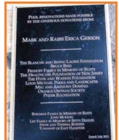
In appreciation, a plaque mounted on a large rock, near the pool site, lists the names of all who donated to the Pool Project.