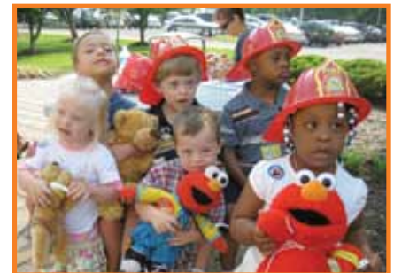
Step III students pose with their stuffed animals at the St. Barnabas Teddy Bear Clinic.

The topics this summer included Beach and Western. Each week the students learned something new about each theme. After completion of each unit the children gathered together to celebrate. A beach party and hoedown were both hits with the kids. Everyone enjoyed ice pops, games and dancing at both parties. It was a great summer and we all look forward to an even better school year. See you in September!