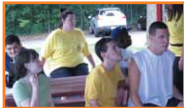
Campers take a break from swimming to listen to the speakers.