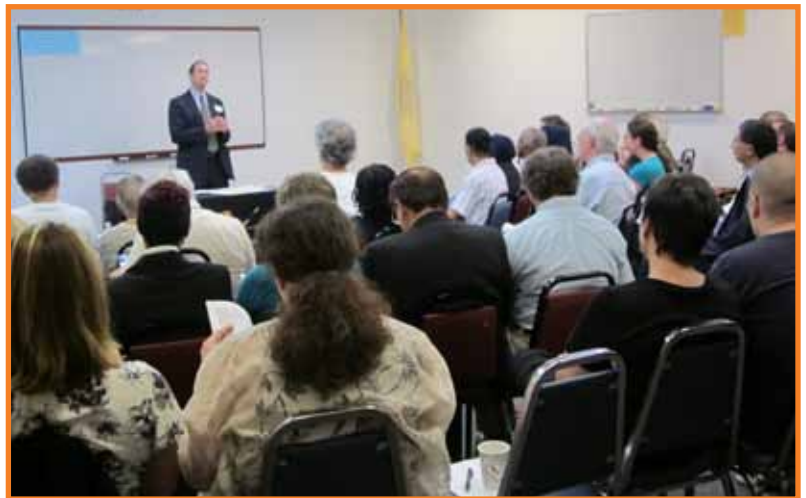
An attentive audience listens to the speaker.

The Arc Annual Membership Meeting held on June 20, 2011 included a presentation on Financial Planning and Guardianship geared to families with a family member who has a developmental disability. There was a good turnout for this program and the information was valuable to those planning for the future of their family members. The Arc thanks Hinkle, Fingles & Prior, P.C. and Ameriprise Financial for providing this valuable and worthwhile service to our families. We look forward to more programs that will provide useful and helpful information to our families.