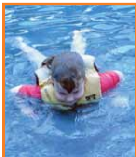
During the Dedication, a camper enjoys the pool's cool water on a hot day.