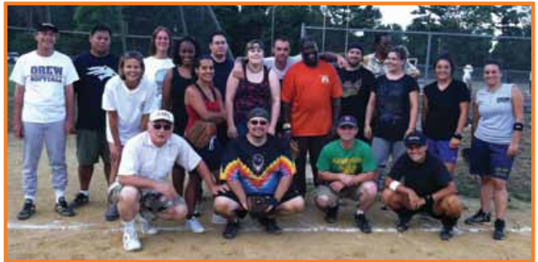
PLAY BALL! The summer heat wave didn't hamper The Arc of Essex vs. Arc of Union Annual Softball Game on July 27. Fans came out to cheer and fun was had by all.