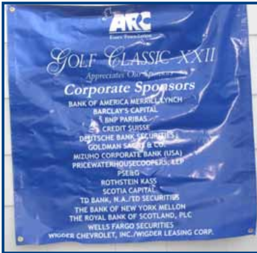
Thanks to our Corporate Sponsors.