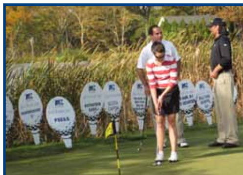
A little practice never hurts.