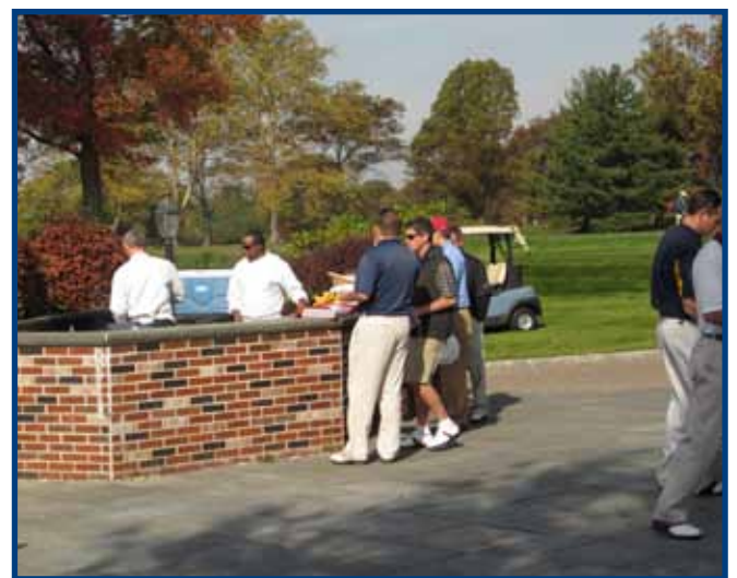
What's looking good for lunch?