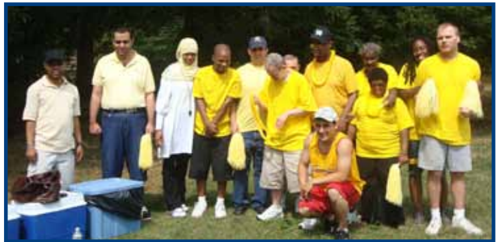
Consumers and staff from REACH gather for a team picture.