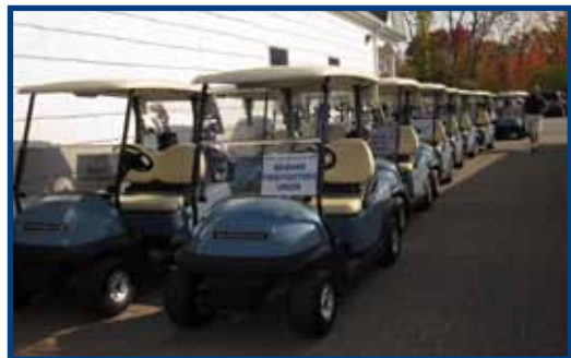
The carts are ready to roll.