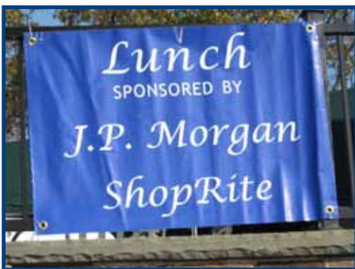
Thank you to our Lunch Sponsors.