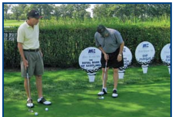
A little practice before the Golf Classic begins is a good idea.