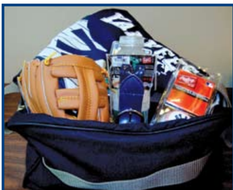
A basket for the Yankee fan.