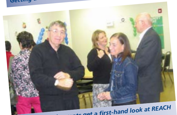
ARC staff and parents get a first-hand look at REACH during the open house.