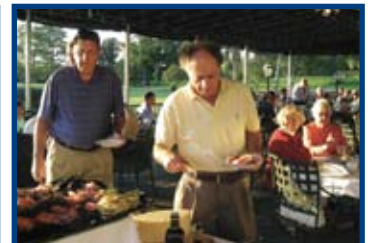
Everything looks delicious!