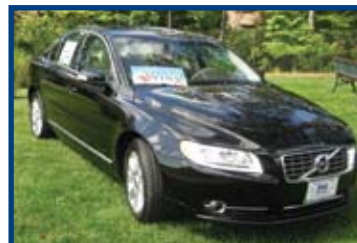
A hole-in-one could win this Volvo from Prestige Volvo.