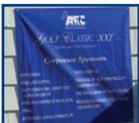
Thanks to our corporate sponsors.