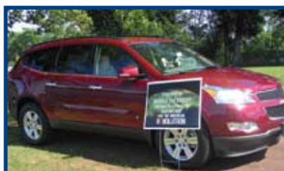
A hole-in-one and you can drive off in this Trailblazer from Wigder Chevrolet, Inc./Wigder Leasing Corp.