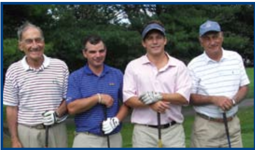
The Mack foursome looks ready for action.

By the end of the evening, many people were leaving with prizes they had won and auction items they had been the top bidders of. With prizes or without, a good time was had by all. We thank photographer Bev Weiss who was out on the course taking pictures of the corporate foursomes. These pictures were presented to our corporate sponsors later in the evening. Thanks to all our sponsors, golfers, donors and volunteers for making this another successful Golf Classic Tournament. Next year's date for Golf Classic Tournament XXII is September 20, 2010 . Think about joining us!